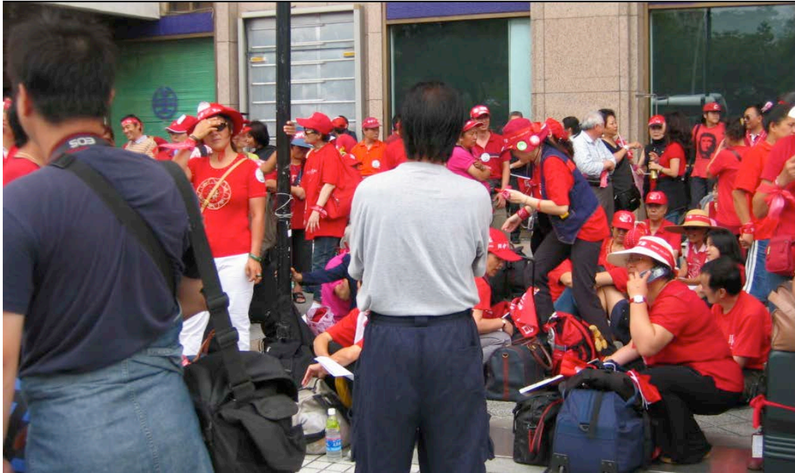
Still from Out of Place - Tai Pei Version by Leung Mee Ping (video installation; 8'00').