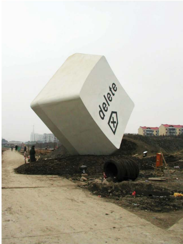
Installation view of Two Sites by Leung Mee Ping at Zhangjiang Road, Zhangjiang High Tech Park, Shanghai, China.