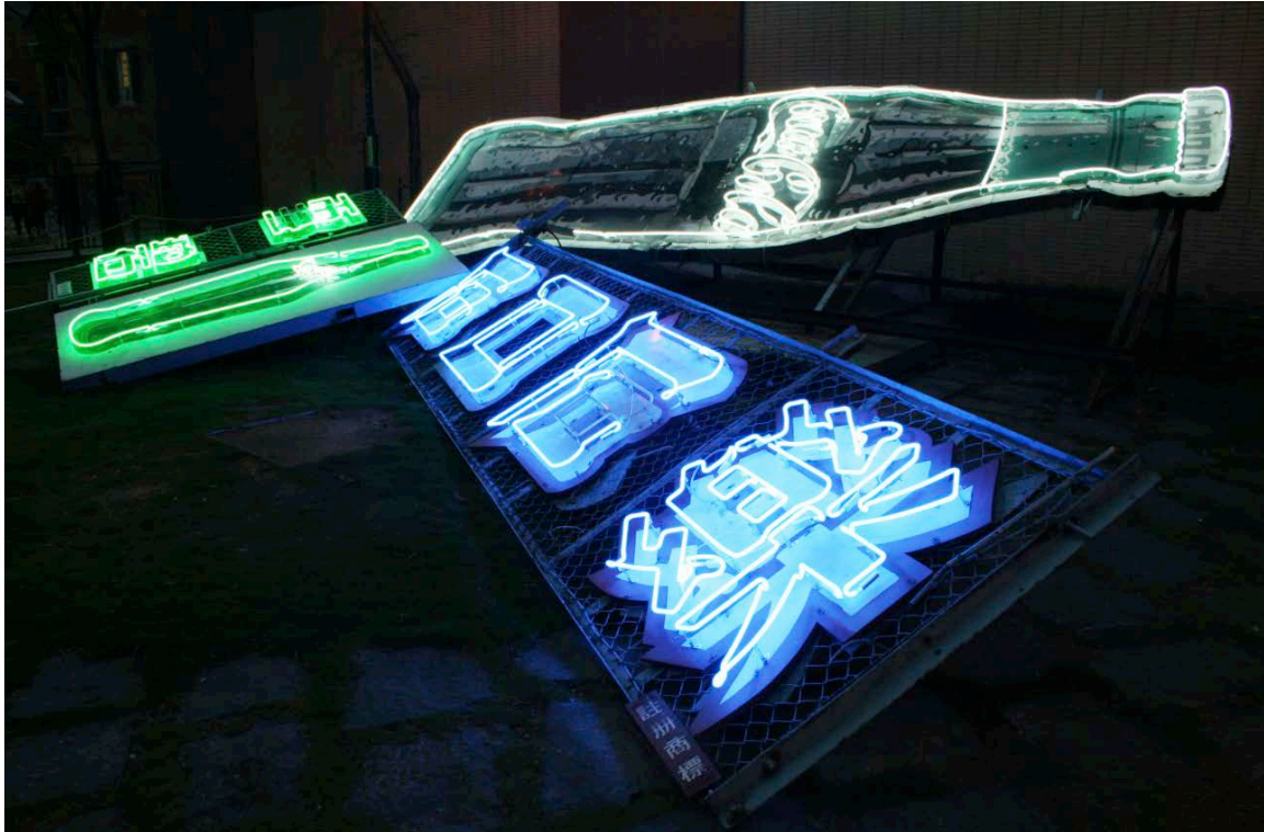
Installation view of I Miss Fanta by Leung Mee Ping at Mobile M+: Yau Ma Tei.