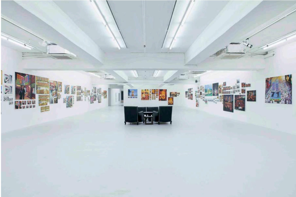
Installation view of Pearl River Delta Series I: Made in Hong Kong by Leung Mee Ping.