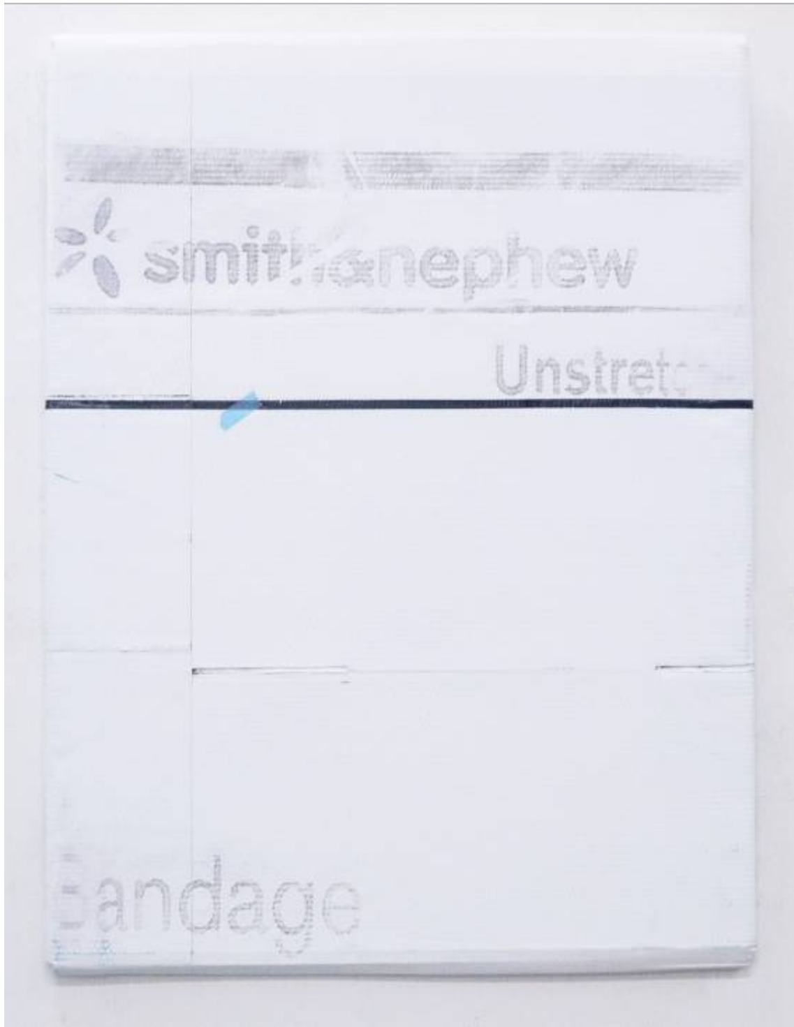
Lee Kit, 2010 Smith & Nephew - Unstretched Acrylic, emulsion paint, inkjet ink and tape on cardboard 100cm X 76cm