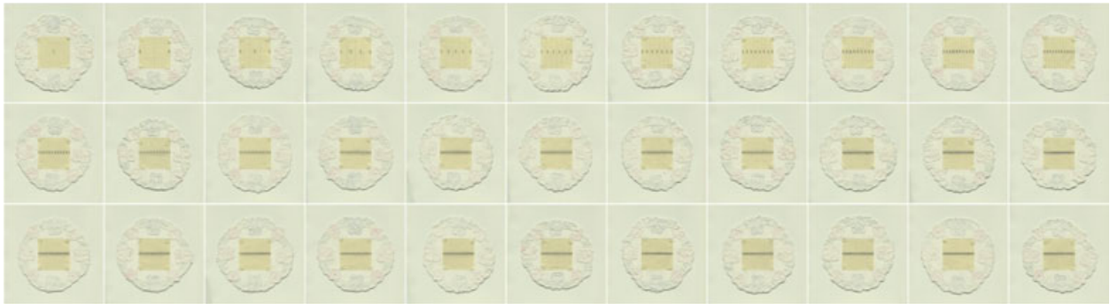
Au Hoi Lam, 33/33 , 2011, pencil and acrylic on cotton