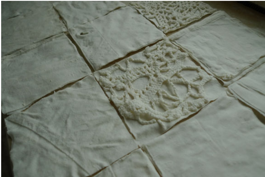
Sara Tse, Dress 01/06/2010-18:30 , 2011, porcelain, dimension variable